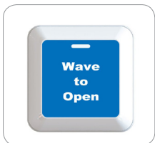
Sticker Option 3