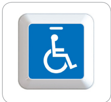
Sticker Option 2