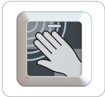
Sticker Option 1