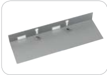
UTB-HR100 Ceiling attached bracket