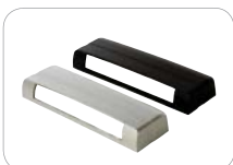
HR94D-COV/BL Black sensor cover HR94D-COV/S Silver sensor cover