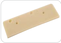
1200R Spacer for installation on a round door