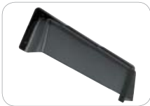
WC/BL Black weather cover