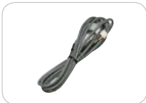
Cable-2.5M Hotron 2.5M Cable