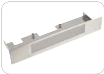
ITB-HR100 Ceiling recessed bracket